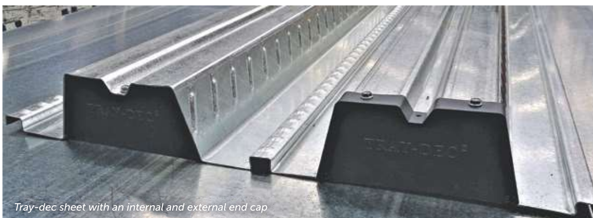
Tray-dec sheet with an internal and external end cap