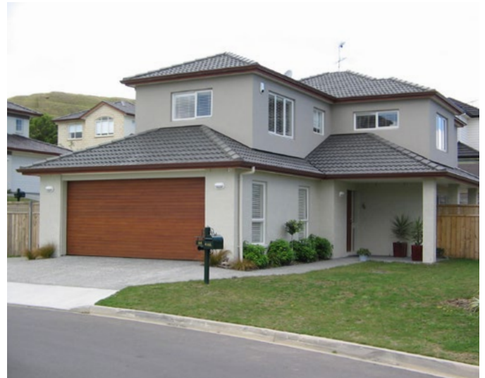
StoArmat Render System on Fibre Cement Sheet