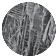
Cell structure – normal kiln dried timber