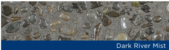
Dark River Mist