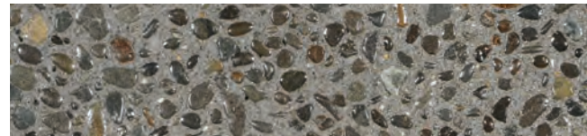
Dark Castle Grey