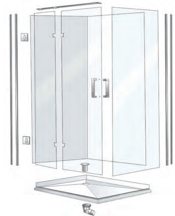
Illustration of 2-walled shower showing hinged door.

Atlantis recommends installation of Black Pearl™ showers is undertaken by a qualified shower installer. See website or call 0800 428 526 for more details.