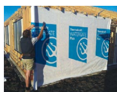
Fix Watergate Plus securely to the frame.