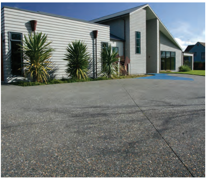
While we have taken care to give an accurate representation of our READY Exposed range, aggregates are natural products, so some variations in colour and stone size will occur. Placing, weather and site conditions may also influence the end result. The examples shown have been sealed.