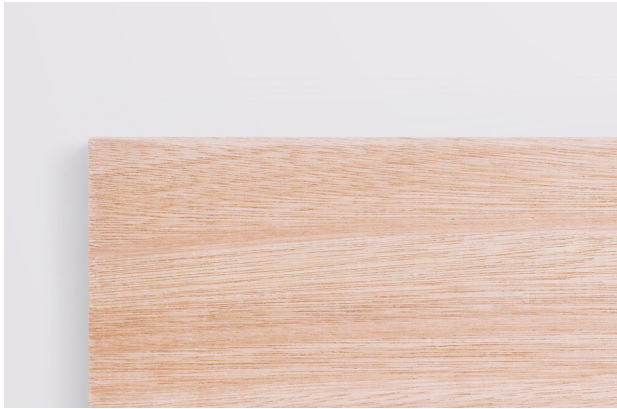
Terra Decking – Uncoated