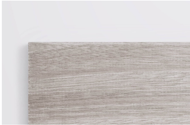
Terra Decking – Sioo:x