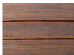
Vulcan Teak As delivered