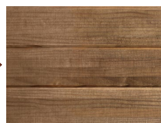
Vulcan Teak Weathered exterior install