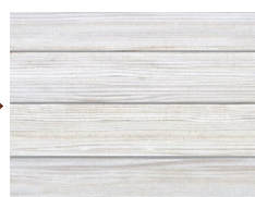
Vulcan Sioo:x Weathered exterior install

We cannot guarantee against wear or color changes to any products which result from weather, sun, wind and/or the natural aging process of the wood.