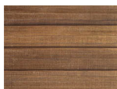
Vulcan Sioo:x As delivered